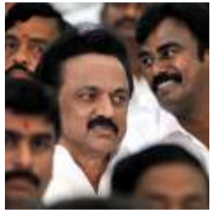
DMK treasurer M.K. Stalin in the ceremony on Monday.