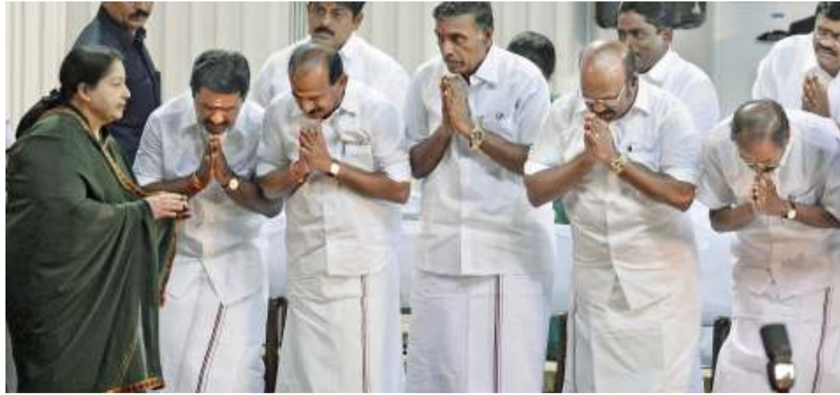
VIP GATHERING: (Clockwise) Newly inducted Ministers greet Chief Minister Jayalalitha at the swearing-in ceremony on Monday. Singer P.Susheela and other stars at the function; a section of the invitees.

Scores of party cadre from all over the State lined up on both sides of Kamaraj Salai to catch a glimpse of Jayalalitha